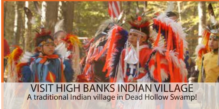
VISIT HIGH BANKS INDIAN VILLAGE A traditional Indian village in Dead Hollow Swamp!