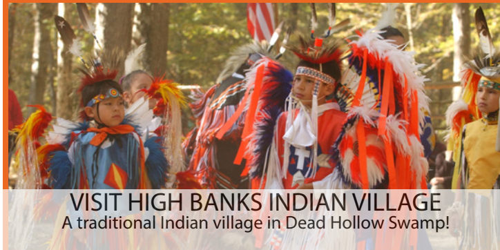
VISIT HIGH BANKS INDIAN VILLAGE A traditional Indian village in Dead Hollow Swamp!